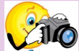
Photo proofs are available to view online. Register with the code on your child's paper proof or the QR code issued on the day by visiting: https://www.photoordering.co.uk/start/

The School Photographers will be visiting again on the 25th November. They will be taking the photos for Ladybird Class and those who have previously requested sibling photos.